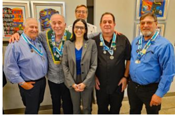
In Atlanta, Lodge Bezalel hosted a joint meeting with Lodge Magen David.