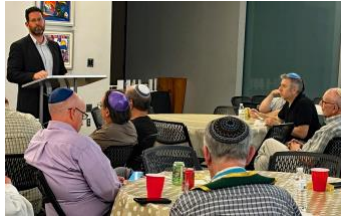
More than 50 brethren and guests turned out to hear Anat Sultan-Dadon, Consul General for the Consulate of Israel in Atlanta, and Royi Ende, Consul and CAO for the Consulate, as Table Lodge speakers at the April 16, 2024 Open Lodge Meeting.