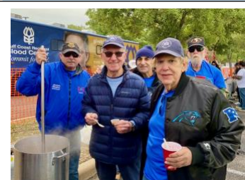
Houston Lodges Galil & Tikvah join forces for the Kosher Chili Cookoff